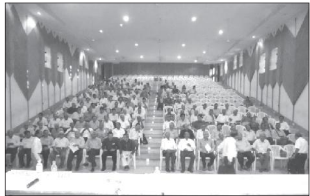
August gathering during AGM